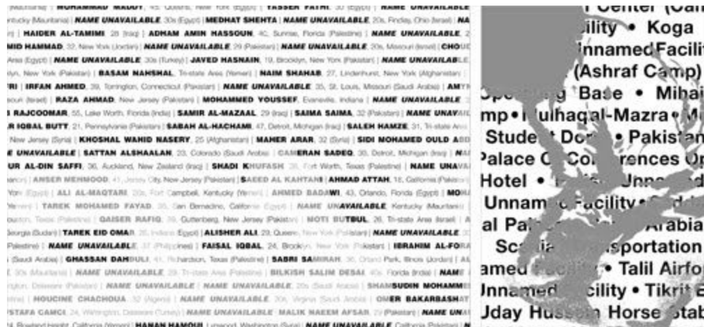
LEFT: Detail from “NAHNU WAHAAD, BUT REALLY ARE WE ONE?” Digital C Print, 8x2', 2005. Visible Collective/Mohaiemen, Roy [Post 9/11 Detainee Names from Migration Policy Institute, Washington DC]